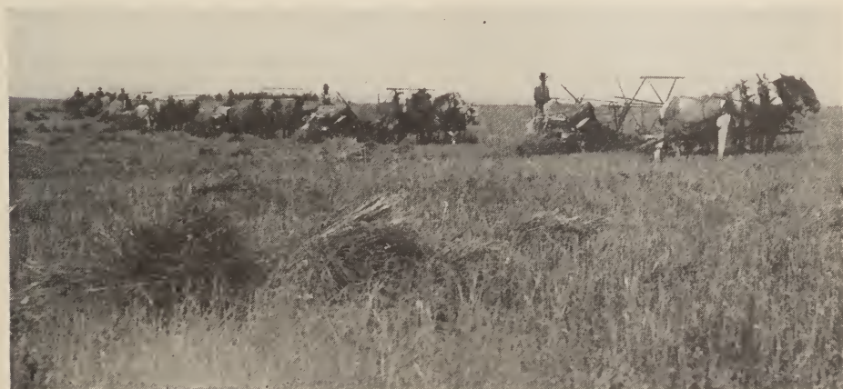
TYPICAL HARVESTING SCENE IN NORTH DAKOTA

"The School of Forestry is located at Bottineau, and is believed to be the only institution of its kind in the United States. The experimental work